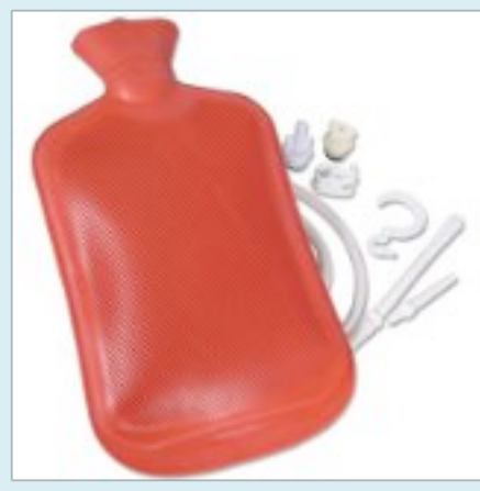
Figure 1. A standard rubber enema/douche bag