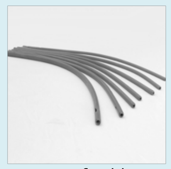
Figure 2. An assortment of rubber colon tubes

Most people do not use colon tubes, which are more difficult to insert. I do not believe using a colon tube is necessary in most cases, though it will move the coffee mixture around the colon better.